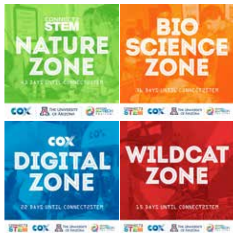
SOCIAL MEDIA POST