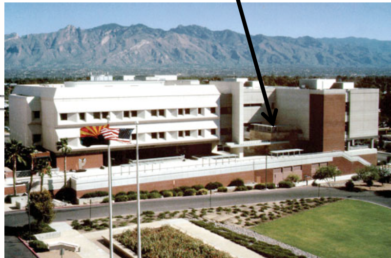
View of University of Arizona Cancer Center from the south, with the Santa Catalina Mountains in the background. Entrance to Banner-University Medical Center is to the left of the photo.